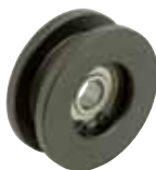
GRL-SH-H (Hardened Steel)