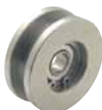
GRL-H-SUS (Stainless Steel)