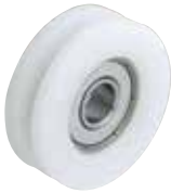
GRL-P-D-SUS (Without Stud)