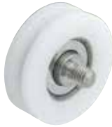
GRL-M-P-D-SUS (With Stud)